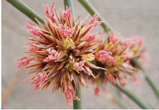
A CHARISMATIC SALT RUSH INFLORESCENCE