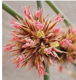
It's the season for awards....pp. 38