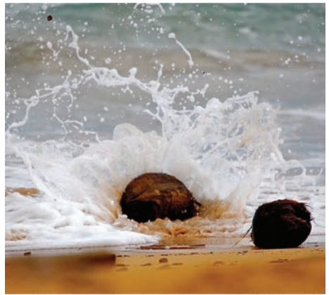
COCOS NUCIFERA (COCONUT) DISPERSAL IN ACTION

Ōhi'a Lehua ( Metrosideros polymorpha ) is Hawai'i's most common native tree with a distribution ranging from coastal forests to the treeline on some of the world's tallest mountains as well as bogs, swamps, and deserts.