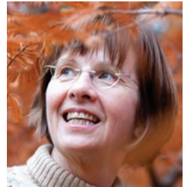
BSA election results...pp. 51