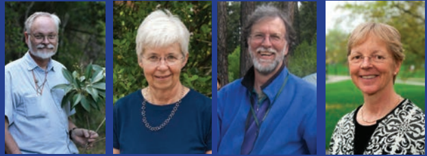
2012 MERIT AWARD WINNERS