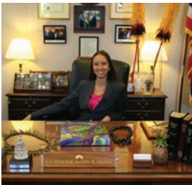
BSA Board Student Representatives visit Capitol Hill...pp. 44