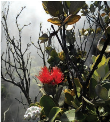
ŌHI'A LEHUA AT ĀKANIKŌLEA

Rushes and other grass-like plants are frequently overlooked amidst a landscape of showy entomophilous (insect-pollinated) flowers. However, up close their inflorescences can be far from drab. The flowers of this coastal Juncus species, J. breweri (salt-rush), possess elaborate stigmas bearing vivid pink lobes, looking very much like ornamented pink corkscrews. Like many other flowering plants, rushes are anemophilous (wind pollinated). Anemophilous flowers tend to lack showy sepals and petals like those of their insect-pollinated relatives and instead opt for large exerted anthers and stigmas, and small pollen grains that are easily carried by the wind. The helical stigma lobes of these salt-rush flowers likely provide optimal surface area for pollen receipt.